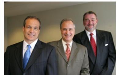
Curd, Galindo & Smith, LLP

Court documents also provide that the tenants have alleged that the defendants have failed to comply with the Health & Safety Code by failing to provide a habitable dwelling and failing to pay relocation